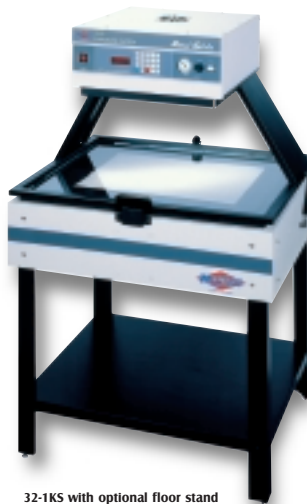
32-1KS with optional floor stand